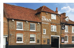
THE SWAN HOTEL