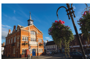
THAME TOWN HALL